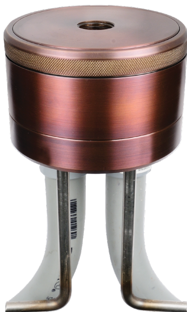
PM-60-1-BLP (Conduit not included)

The PM Pedestal Mount , part of the most comprehensive ground mount system available, is a robust, solid brass mount designed to be cast into a concrete pedestal creating a durable, unmovable mount point for residential or commercial projects. It features two 3/4" bottom conduit entries for simple through wiring and two stainless steel J-bolts for a durable installation. This unit can be buried within 1" of the top, even in exterior wet locations. Available with a 120 to 12v electronic transformer option for mounting low voltage luminaires. The PM is machined from Solid Brass for extreme durability; our fixture mounts are built to the exact quality specifications as our entire family of fixtures. Our proprietary screwless faceplate eliminates twisted wires and visible screws to make installation fast and neat.